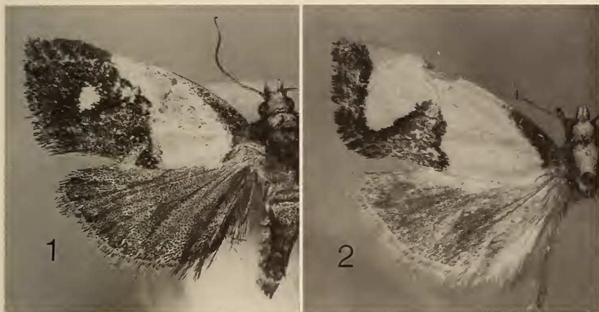
FIGS. 1-2. Adults of Argentulia . 1, Female of A. montana . 2, Male of A. gentilii .